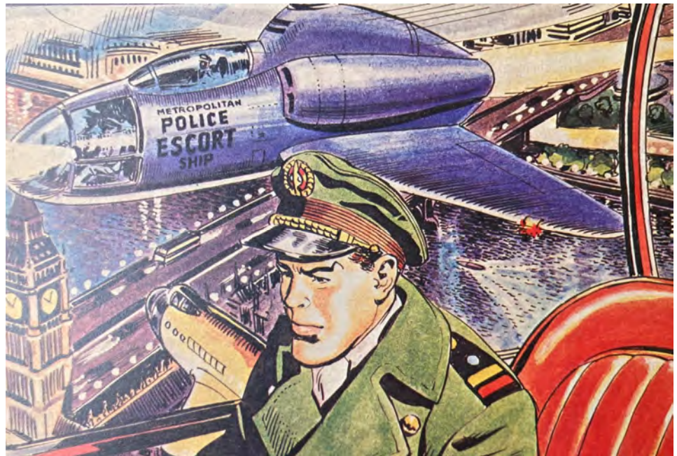
Dan Dare pilot of the future from The Eagle comic