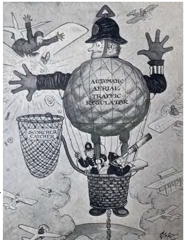
You could understand a degree of naivety about air policing a century ago but today's leaders have no excuse for failing to understand the challenges of the technology. This image was published in 1915.

At the recent Dubai Air Show the manufacturer of the Reaper/ Sea Guardian stated “There are companies out there that want you to believe you can replace the capability of a Reaper or Sea Guardian with (a cheaper alternative). The only catch is they would need a billion dollars to invent some magical artificial intelligence to make them relevant.”