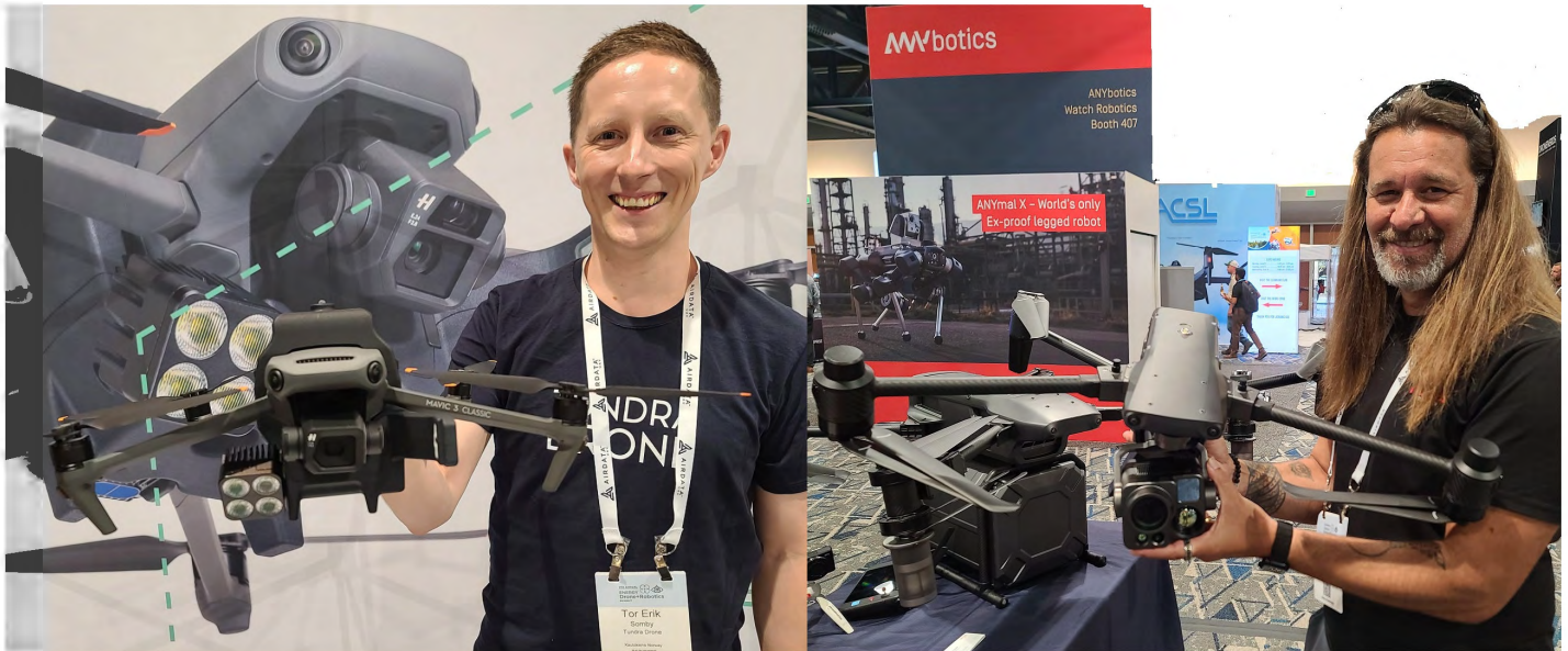
Tundra Drones from Kautokeino, Norway are offering add-on lights for DJI drone