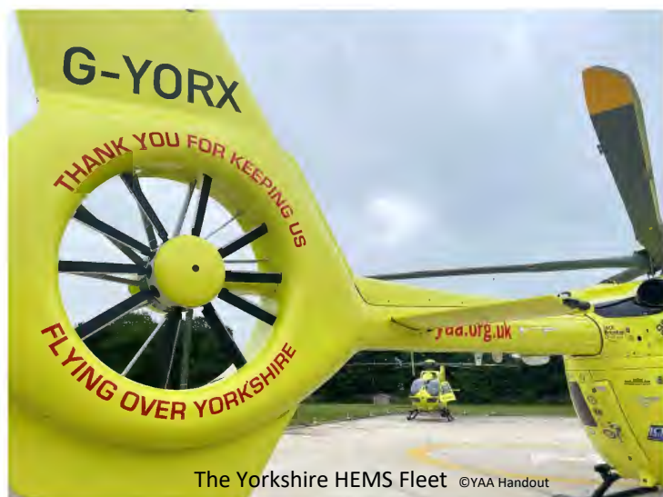
The Yorkshire HEMS Fleet

The annual family-friendly event returns with fun activities for everyone. The day provides activities including demonstrations of the lifesaving treatment by crews, merchandise stalls, refreshments and a raffle. Other local emergency services including Staffordshire Police, Staffordshire Fire and Rescue Service and West Midlands Ambulance Service will also be attending to give a behind-the-scenes look at some of their vehicles and operations.