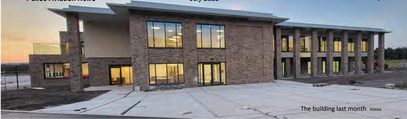
The building last month

MIDLANDS: This month should see the 32-years old charity occupy its new airbase and charity head-quarters located a short distance from the current base on RAF Cosford.