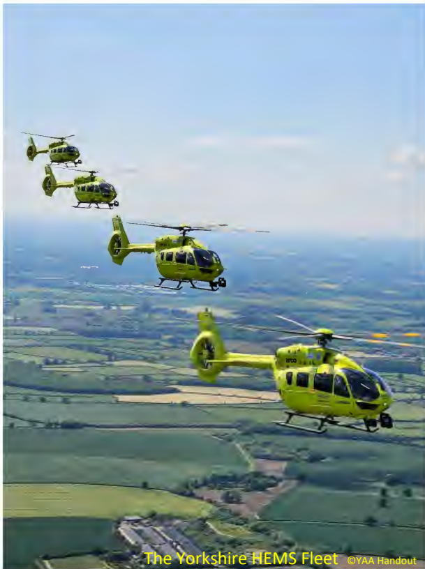
The Yorkshire HEMS Fleet

The crew took the four helicopters on a brief flight, incorporating some training & familiarisation for the Pilots & Technical Crew Members (TCM's), treating onlookers to a unique and rare display.