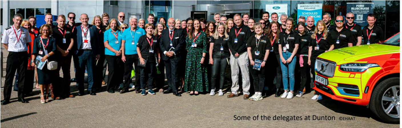
Some of the delegates at Dunton

With over 400 delegates attending, the Essex & Herts Air Ambulance (EHAAT) annual Aeromedical Conference provided a unique platform for all those working in emergency services, to come together, share knowledge, and work towards enhancing best practice in the pre-hospital care environment.