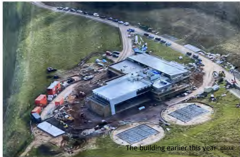
The building earlier this year

A feasibility study into the possibility of building a combined airbase and charity headquarters was undertaken four years ago, when the charity acknowledged a number of challenges its essential serviced faced.